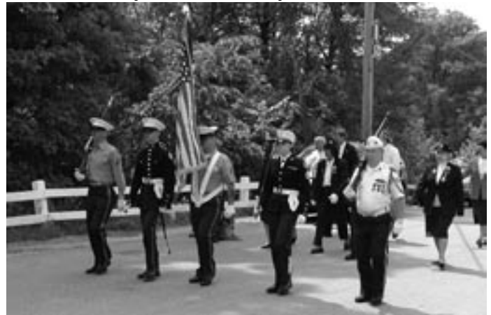
2009 Memorial Day Exercises will be held at 2 pm on The Common, followed by a Memorial Day Pot Luck Luncheon for all townspeople at 3 pm. Veterans are guests – all others please bring a dish to pass.